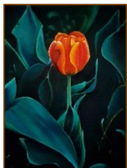
Cathie Waller Red Tulip